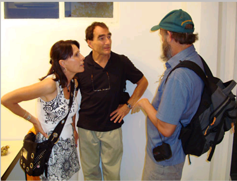
FOTOSEPTIEMBRE USA guests at the Robot Art Gallery's Photo Design exhibit.