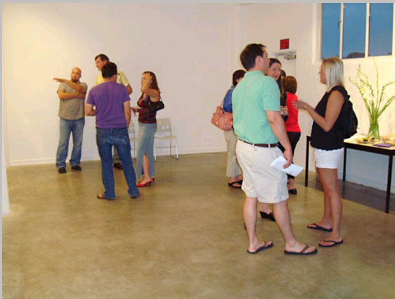
Photo Design opening reception at Robot Art Gallery.